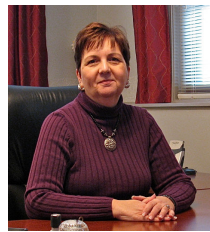
Client Spotlight Riding Tax & Accounting