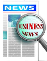
Reminder for Business Owners