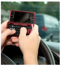
Mass. New Law on Distracted Driving — The First 90 Days